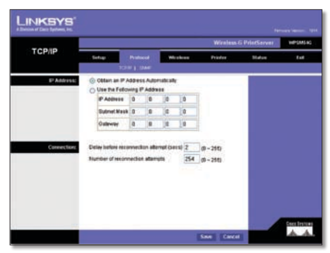
Protocol > TCP/IP

Click the TCP/IP tab to view or change the TCP/IP values of the PrintServer.